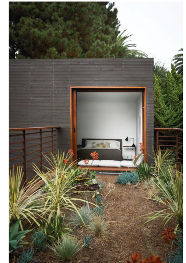
Venice House by Sebastian Mariscal

To read the full article about creating design oomph with natural timber cladding and see more examples visit my blog at www.designprojector.com.au/blog .